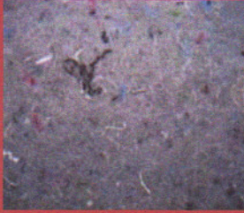
Textile Plant Dust